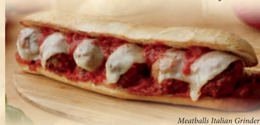
Meatballs Italian Grinder

Hot Italian Sub Fresh ham, salami & provolone, baked & topped with lettuce, tomatoes & banana peppers, served with our homemade Italian dressing 8.99